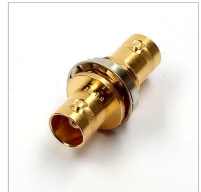
preferably for Patch Panels