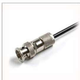
Cable Plug solder/clamp connection with additional clamping of the cable sheath

The version with solder/clamp connection can be equipped with additional clamping of the cable sheath and so provide a more effective cable strain relief 2 .